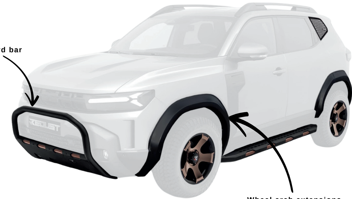
Wheel arch extensions