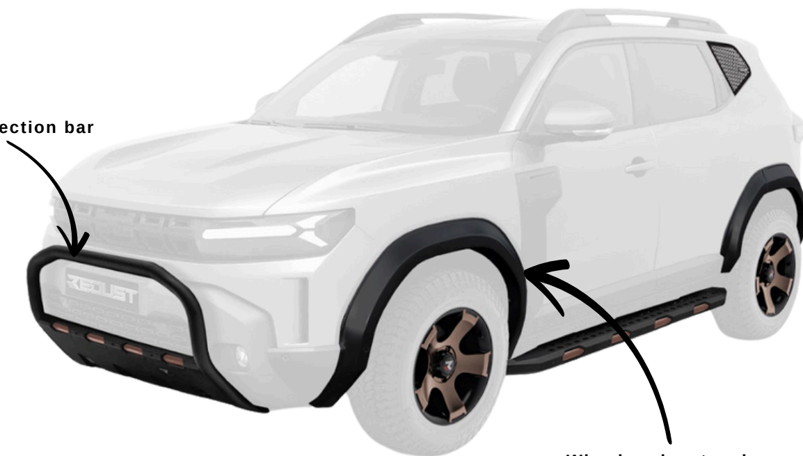
Wheel arch extensions